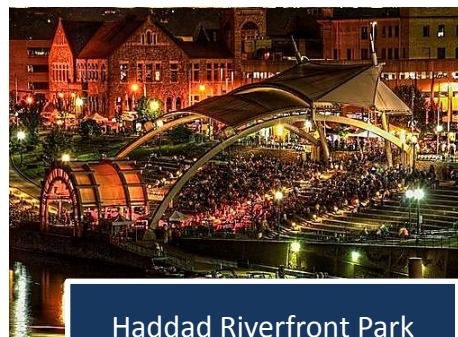
Haddad Riverfront Park