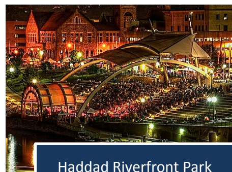
Haddad Riverfront Park