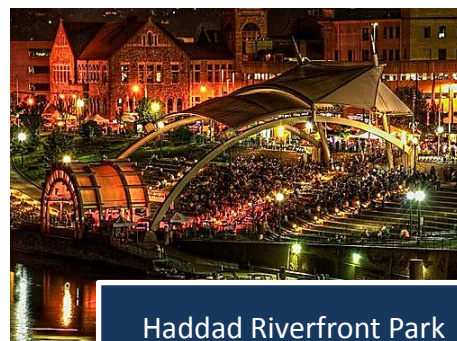
Haddad Riverfront Park