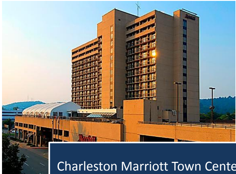
Charleston Marriott Town Center

The 2016 Annual Convention is being held at Charleston Marriott Town Center in Charleston, WV. For reservations call 1-800-228-9290, or direct at 304-345-6500. The hotel is situated in downtown Charleston, West Virginia, at the junction of Routes 64, 77, and 79. A block of rooms will be available at a conference rate of $105 per night. Deadline to take advantage of these rates is September 9, 2016.